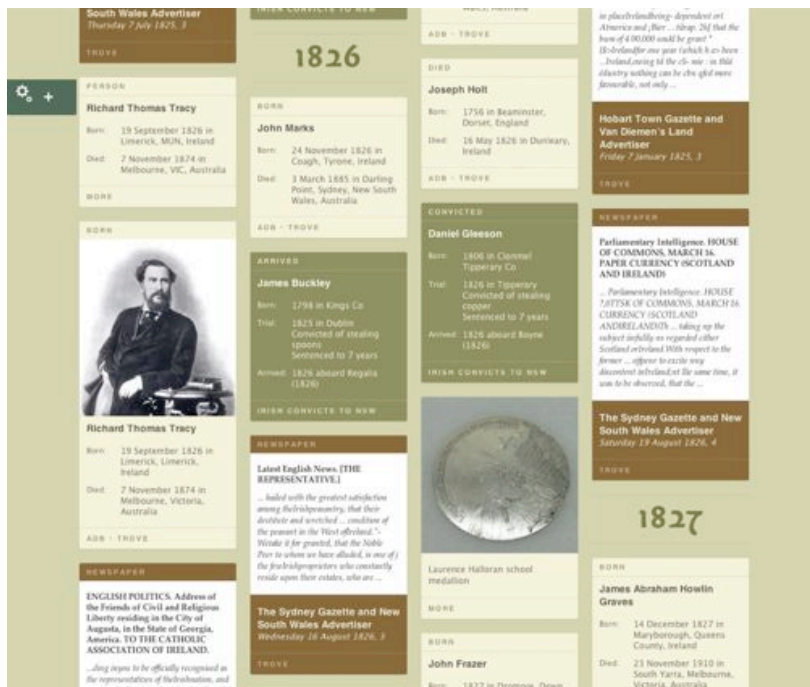
Figure 1. The Irish In Australia History Wall - National Museum of Australia, developed by Tim Sherratt.

Current practice in archival collections shows that while search remains dominant, glimmers of generosity are evident. What would a truly (and deliberately) generous collection interface look like? Is such a thing even possible? There are a number of examples within the cultural collections sector that strongly suggest a turn towards more generous interfaces. For example Discovering Mildenhall's Canberra , a collaboration between the National Archives of Australia and the Museum of Australian Democracy at Old Parliament House, presents an immersive, exploratory view of some 7700 historic photographs. The National Library of Australia's Australian Womens' Weekly project is a similarly rich, browsable interface; and the Irish in Australia Wall, from the National Museum of Australia, shows how multiple collections can be combined into a generous mosaic of intriguing connections and contexts (Figure 1).